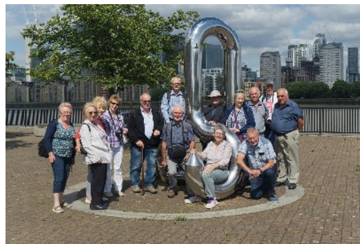
The team relax on the south side of "Docklands"