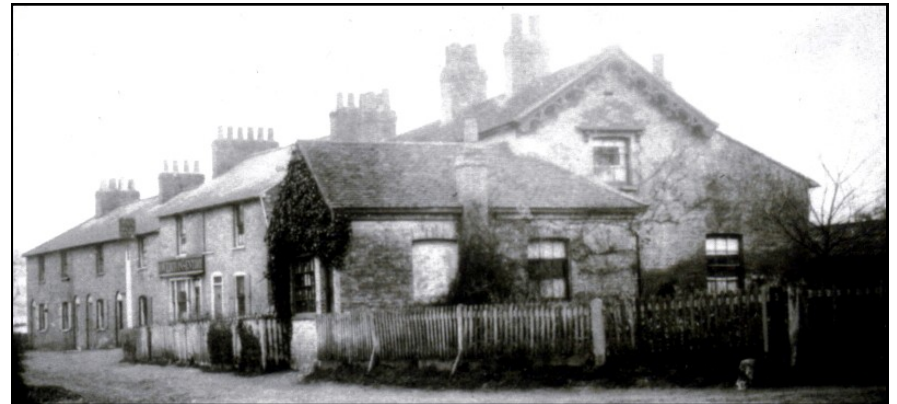
The Leather Bottle

The arrival of the station made little difference to the village, with only a little speculative building taking place i.e. Sussex Road, Surrey, Kent and North Roads. The Railway Hotel was built which replaced the historic Leather Bottle Beer House at Wickham Green.