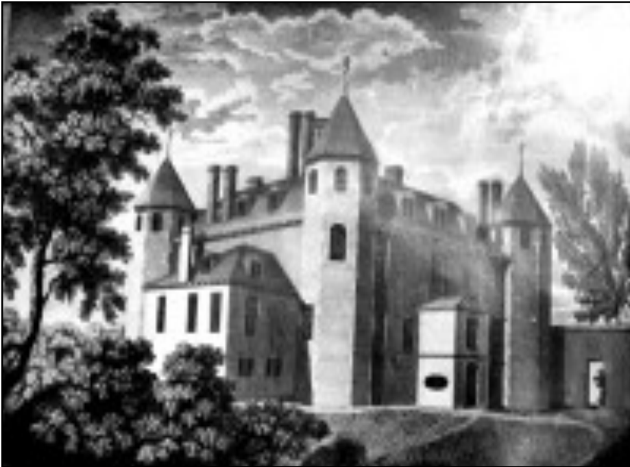
Wickham Court (Now Grade I listed)